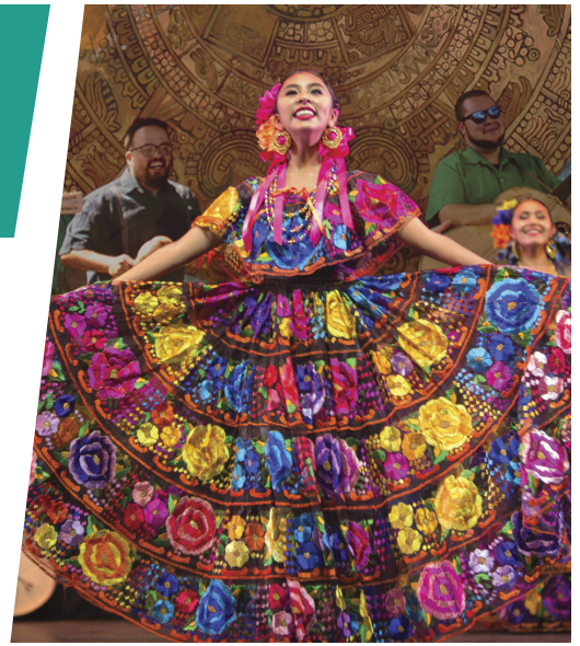
Ballet Folklórico de Los Ángeles

This study guide contains activities and resources to help you extend the lessons brought to your students through the Carpenter Center's Classroom Connections program with Ballet Folklórico de Los Ángeles.